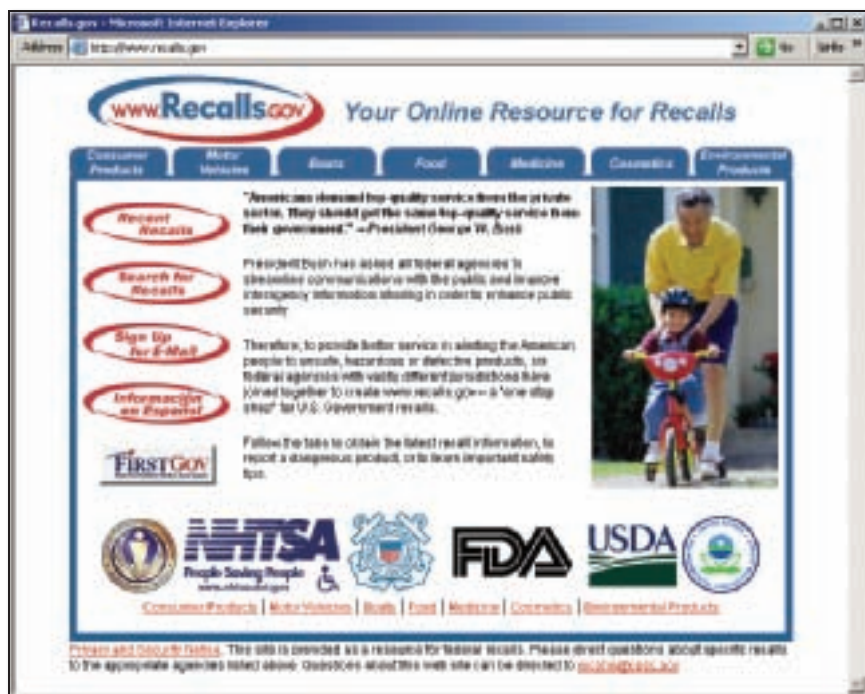
Figure 24.1 — Finding Information About Recalls —

Consumer Product Recalls Six federal agencies joined together to create this Web site to give consumers information about the latest recalls and to provide safety tips. It also accepts consumer reports about dangerous products. In what other places can you find information about recalls?